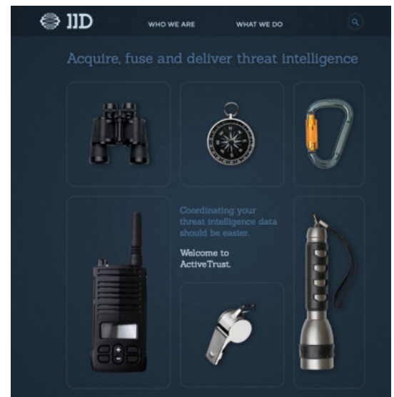
Website launched Feb 2014